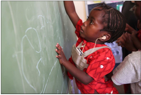
Some of the photos from previous years have become my all-time favourites. There are many more that I could have selected to brighten up this page. Look at the joy, concentration and happiness in the faces of these children, who, for a certain time in their lives, have been "our" children... and be inspired!